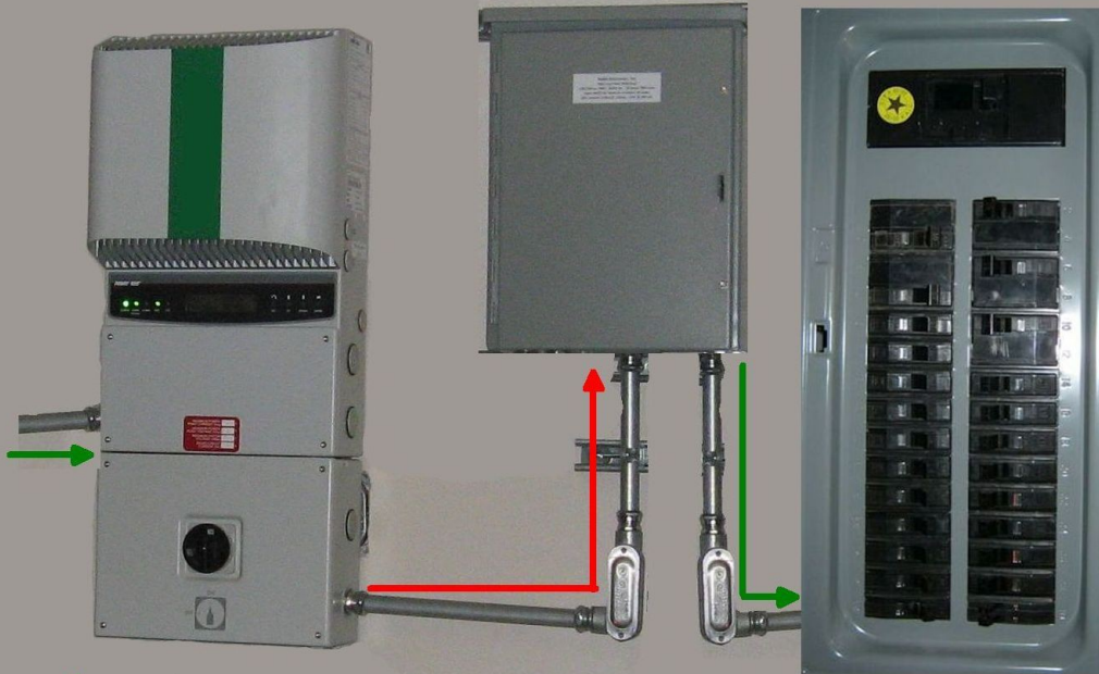
Circuit Breaker Box

Green Arrow above is clean DC Power, from the Solar Array, going into the solar Inverter to be converted into AC Power.